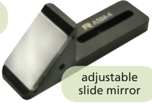
adjustable slide mirror