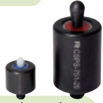
spring pusher standoff clamps