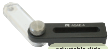
adjustable slide acrylic extension