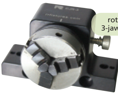
rotating 3-jaw clamp