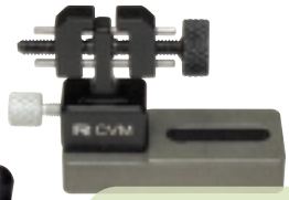
micro vise clamp with base